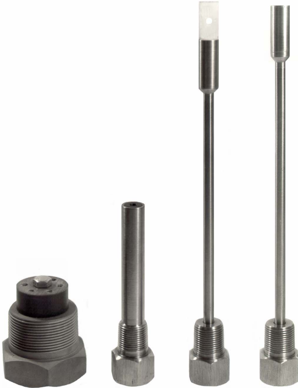
MULTIPLE ROD TYPE HIGH VELOCITY FLAT STANDARD ROD STANDARD